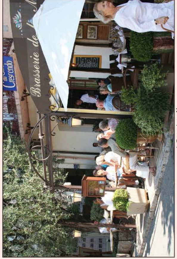
A French café

Official Language French Government Multiparty Republic Borders Andorra, Belgium, Germany, Italy, Spain, Switzerland