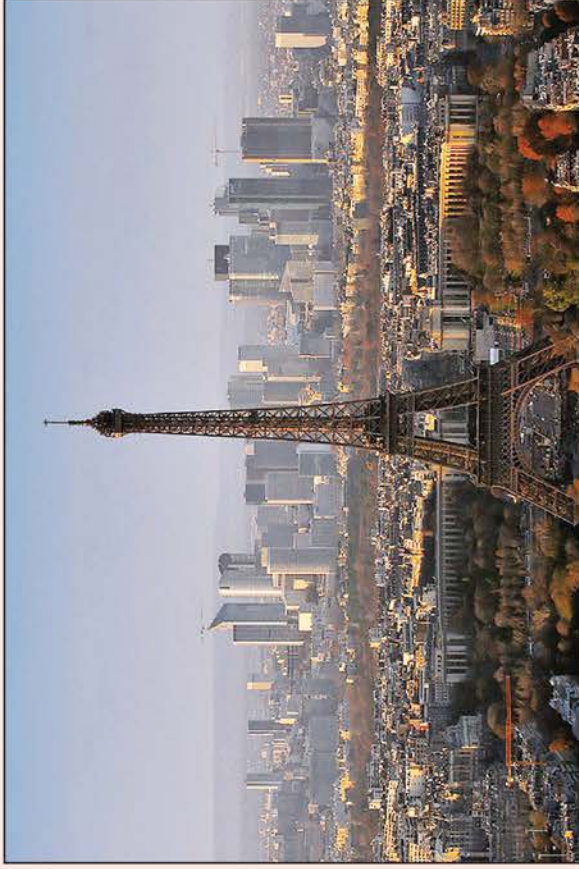
The Eiffel Tower in Paris