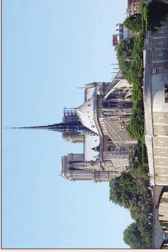
Notre Dame Cathedral in Paris

Location Western Europe Area 551,500 sq km Population 62 million Joined the EU 1957